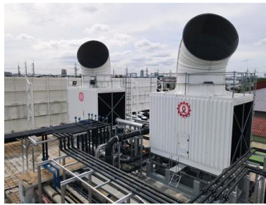
Cooling Tower Installation