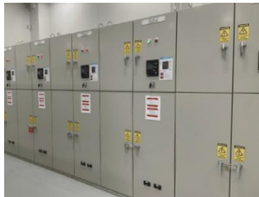
Medium Voltage Substation