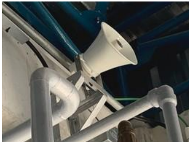
Public Address System