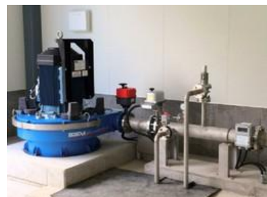
Small Hydric Generator