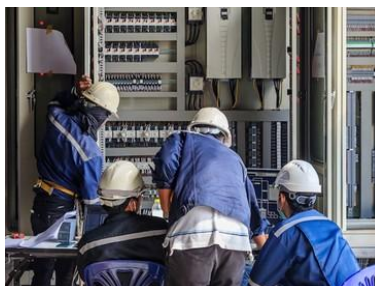
Maintenance & Improvement