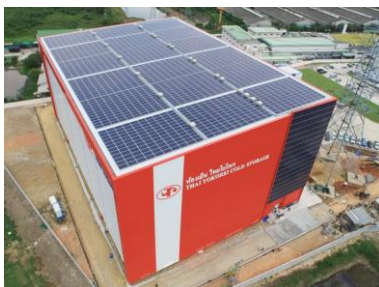
Solar Power Generation