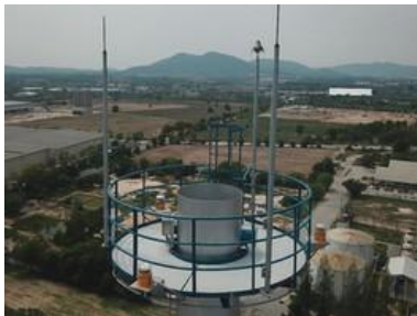
Lightning Protection System