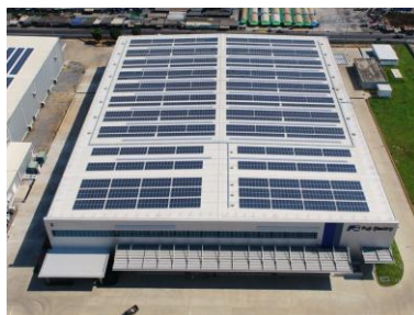
Solar Power Generation