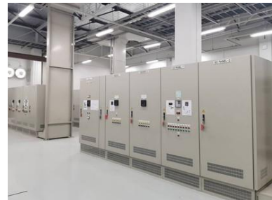
Low Voltage Substation