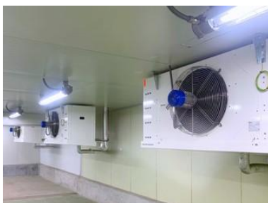
Freeze Room System