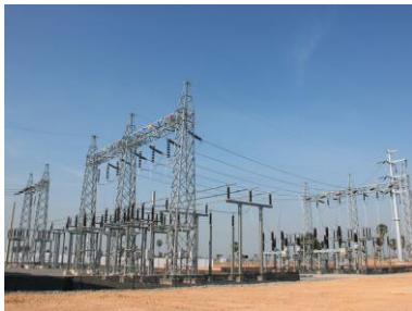
High Voltage Substation