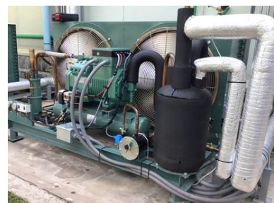
Compressor Unit Installation