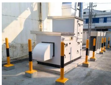
Air Handle Unit Installation