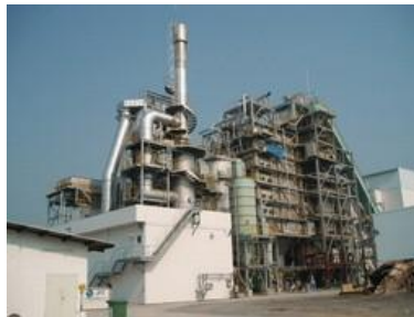
Instrument work installation