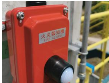
Fire Alarm System