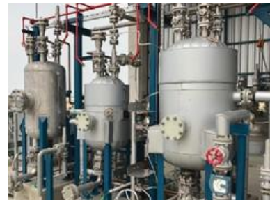
Calibration & Testing